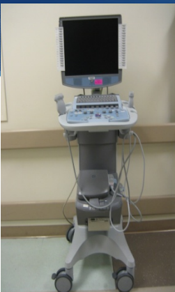
Patient info entered into U/S Machine